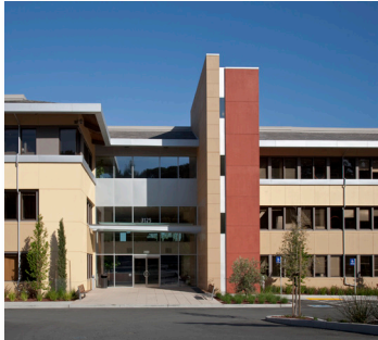
ClearView Business Center